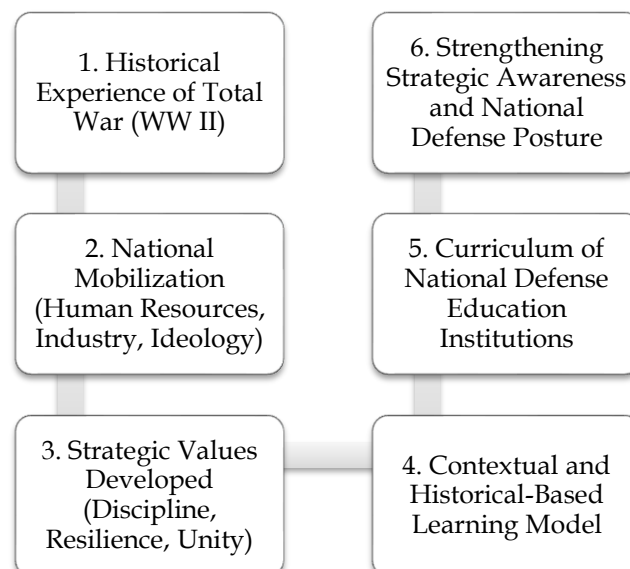
Figure 2. Integrating Lessons from Total War into Modern Defense Education

Moreover, invoking the total war experience extends beyond historical analysis and demands the fostering of a robust civic education framework that cultivates nationalism and love for the homeland among youth. This relevance of citizenship education as a pillar of national defense has been emphasized, promoting an ethical commitment to civic duties that enhance national security (Ali, 2022); (Dahliyana et al., 2024). The integration of these values into the educational curriculum is vital for developing responsible citizens who are not only aware of national interests but are also committed to their defense (Yunita & Nastiti Mufidah, 2022). This serves the dual purpose of rebuilding national unity and fostering a resilient society equipped to tackle both external threats and internal divisive forces.