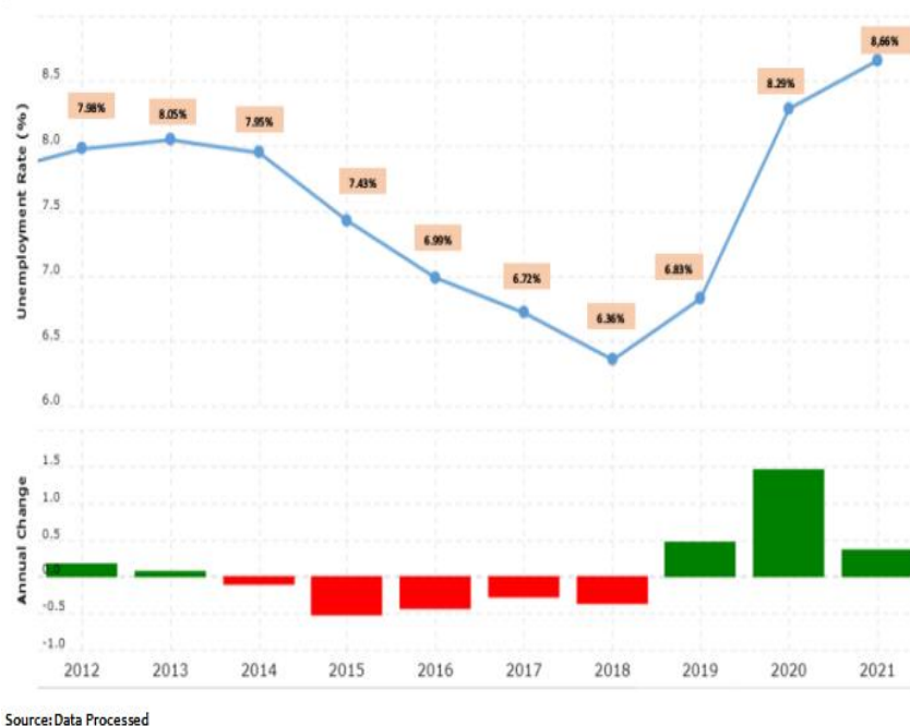
Figure 1. Economic Uncertainty Conditions

Public-private partnership. This model mixed the economy traditionally featured centralized wage negotiations and a heavily tax-subsidized social security network. The main characteristics of modern Sweden (or the 'Swedish model') are arguably related to the country's sophisticated and knowledge-intensive industry and its advanced welfare state. Both of these features have developed gradually over time, and a summary of these development processes may reveal some of the decisive policy steps as well as the structural conditions that have made it possible to achieve both industrial success and a high level of social welfare. This situation did not just happen, Sweden has learned from the crisis that has hit their country. Then now, the Swedes still can enjoy an advanced welfare system either in the crisis condition, and their standard of living and life expectancy are among the highest in the world. The unemployment rate of Swedish around 2018 till 2022 shows in the graph below tends to increase during the economic uncertainty conditions since 2019 until 2022 (Kokko, 2010).